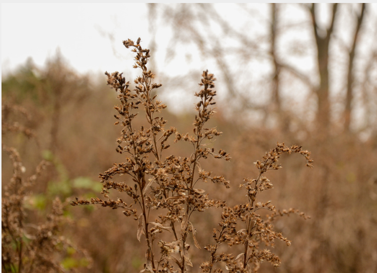
Hanna Lighthall, Beaver River