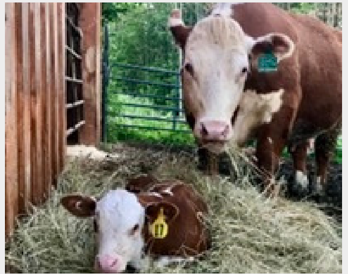
Ava Castine, Northern Adirondack