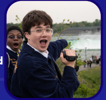
Sign up for tours and learn about different aspects of ag, food and natural resources!