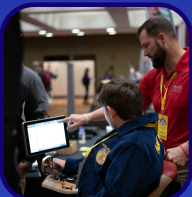
Explore opportunities at the State Convention Expo!