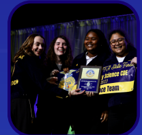
Earn recognition for excellence through awards programs!