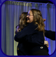
Connect (or re-connect!) with FFA members across New York!