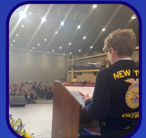
Use your voice in state FFA actions as a delegate!