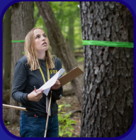
Compete at the state level in CDEs and LDEs!