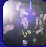
Sign up for the NY FFA social night with food and entertainment!