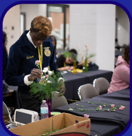
Be part of something bigger than yourself in onsite and offsite service projects!